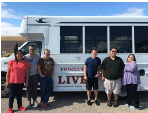
Some transportation Provided by Project LIVE Bus

Each transitional plan is individually created to the strengths, interests, and preferences of each young adult in the Project LIVE program.