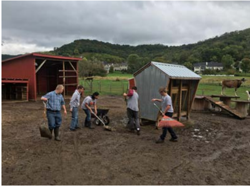
Students working at Clearwater Farms

Project LIVE is a 100% community based program that enhances the lives of individuals with varying abilities. This program offers unique supports in areas that will give the individual lifelong learning skills to improve independence, work towards life goals and assist in transition to adulthood.